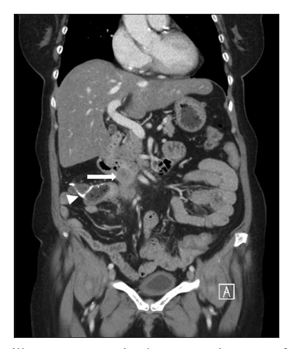
Figure 2. Surveillance computerized tomography scan of abdomen and pelvis showing the ileocolic anastomosis (white arrowhead) as well as a duodenal invasion (white arrows).

Histology revealed a moderately differentiated adenocarcinoma, suggestive of recurrence of the previously resected tumor, directly invading the duodenum. The proximal and distal margins of the ileocolic resection were uninvolved by the invasive carcinoma, and metastasis in five out of 12 regional lymph nodes was found. The postoperative course was complicated by a Grade B POPF according to the International Study Group of Pancreatic Surgery definition and this was managed with antibiotics and percutaneous image-guided drainage. The patient recovered well. However, a CT scan done at 3 months showed sub-centimetre hepatic lesions suspicious of metastases (Figure 1). Considering patient preferences for omitting intravenous chemotherapy, palliative oral capecitabine was commenced. She died of metastatic disease 28 months after the index surgery (Figure 1).