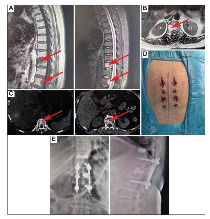
Figure 1. (A) Sagittal magnetic resonance imaging (MRI) shows a significant vertebral mass in T11 and L1, which was due to cancer metastasis in a 67-year-old woman. (B) Axial MRI shows a significant vertebral mass in L1. (C) Axial computed tomography shows lesions in the T11 and L1 vertebral bodies. (D) The picture shows the size of the wound after the operation. (E) Frontal and lateral views of the post-operative radiographs (Case 6).

The spinal instability neoplastic score (SINS) system, developed by the Spinal Oncology Study Group, was used to assess spinal stability (Table 1) [8]. Spinal stability was evaluated by six aspects, including spine location, mechanical pain, bone lesion quality, spinal alignment, vertebral body collapse, and posterolateral involvement of the spinal elements, and corresponding scores were obtained [9]. Spinal stability was assessed by SINS system. In addition, patients were evaluated