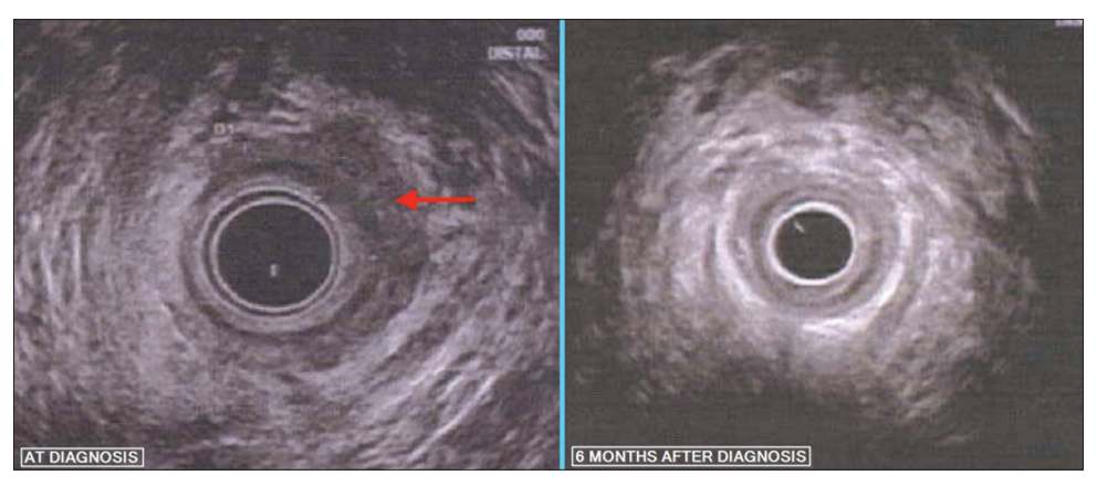
Figure 2. Endoscopic ultrasound at diagnosis and after chemoradiotherapy. The red arrow points toward an anal tumor that was noted on the initial examination.