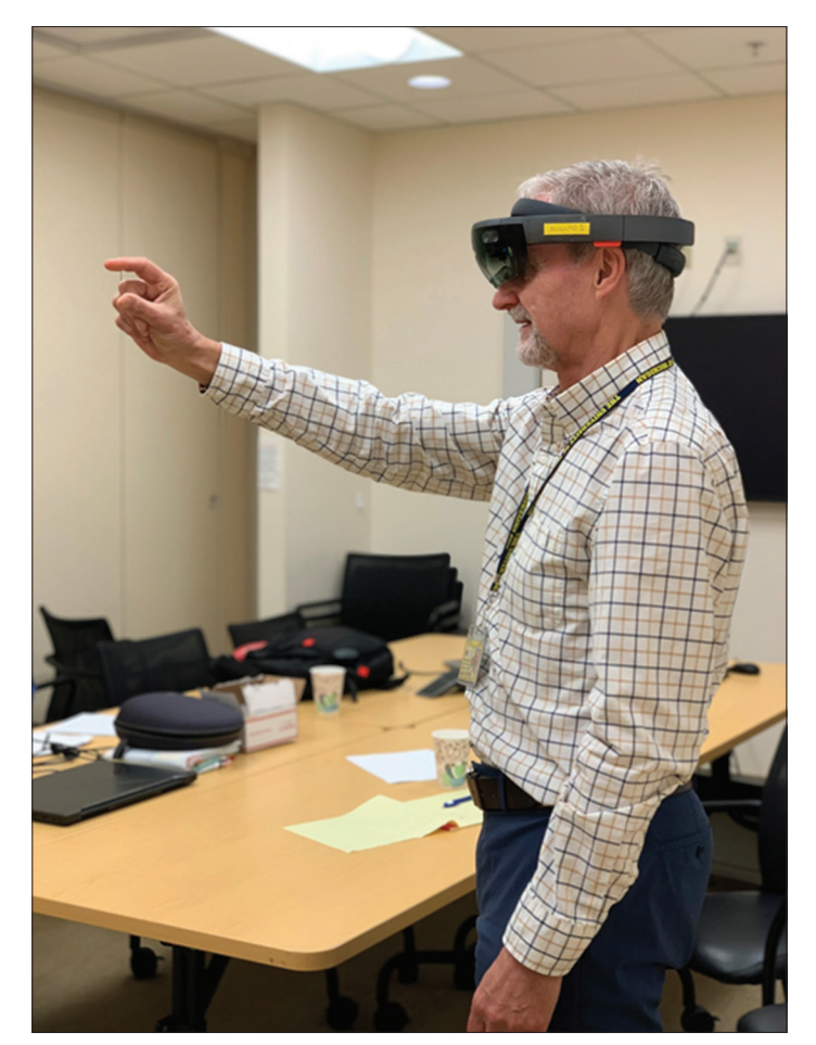
Figure 2. Image 2: Practicing directive gestures using the virtual reality trainer.<sup>1</sup>

Multiple interventions and management options were available to the participants during the scenario. Only correct interventions, registered with the system in the correct sequence, and allowed the participant to progress through the scenario.