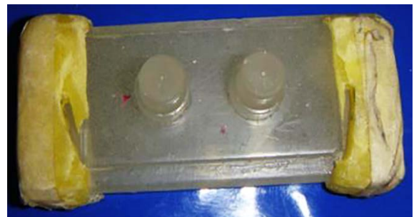
Figure 1. Three-unit fixed partial denture master model.

A simulated three-unit bridge master model was fabricated using acrylic resin (Figure 1). A dimple was created on the occlusal surface of both abutments as a reference point for measurement of inter-abutment distance (Figure 2A). Grooves were created on the axial surface and shoulder margin of the abutment for measurement of the occlusogingival length and shoulder width, respectively (Figure 2B).