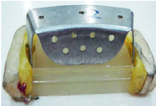
Figure 3. Perforated sectional tray with grooves on the base of the master model.

Measurements were made and compared between the master model and the produced die models for the inter-abutment distance, occlusogingival length, and shoulder width. A perforated sectional tray was used to make the impression of the master model. In addition, two grooves were created on the base of acrylic resin model for the tray to be placed accurately on the master model during the impression taking procedure and to standardize the path of insertion and removal (Figure 3).